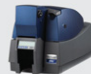
Datacard® card printers